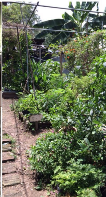
Flourishing form which is also the source of our lunch