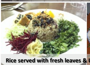
Rice served with fresh leaves &amp; Ulam