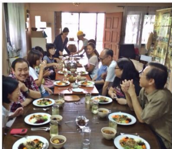
Patiently waiting for makan