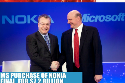
MS PURCHASE OF NOKIA FINAL FOR $7.2 BILLION